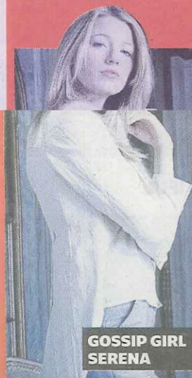
GOSSIP GIRL SERENA

US hit Gossip Girl is on ITV2 every Thursday. It's all about the scandalous lives of privileged Manhattan prep school teens. Gossip Girl is the mysterious blogger who keeps the world up to date with the latest news.